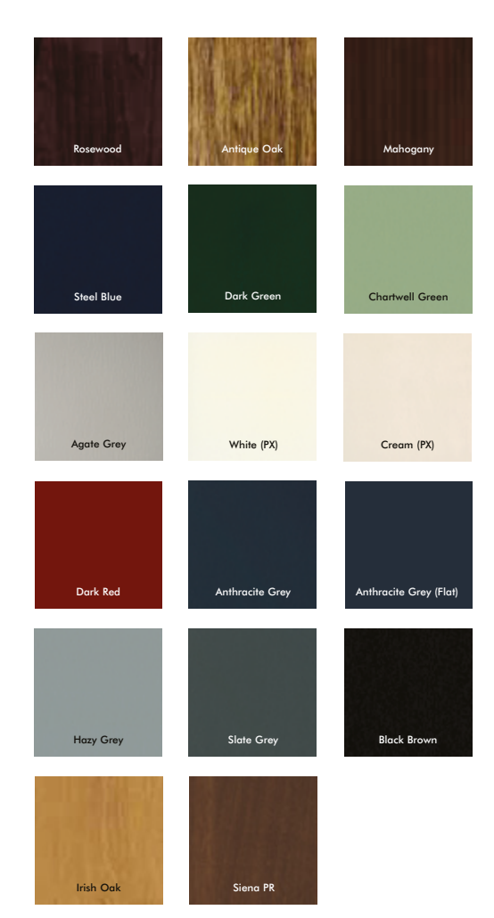
All colours are a visual representation only.

Available in White, Gold, Brass, Chrome, Black and Silver.